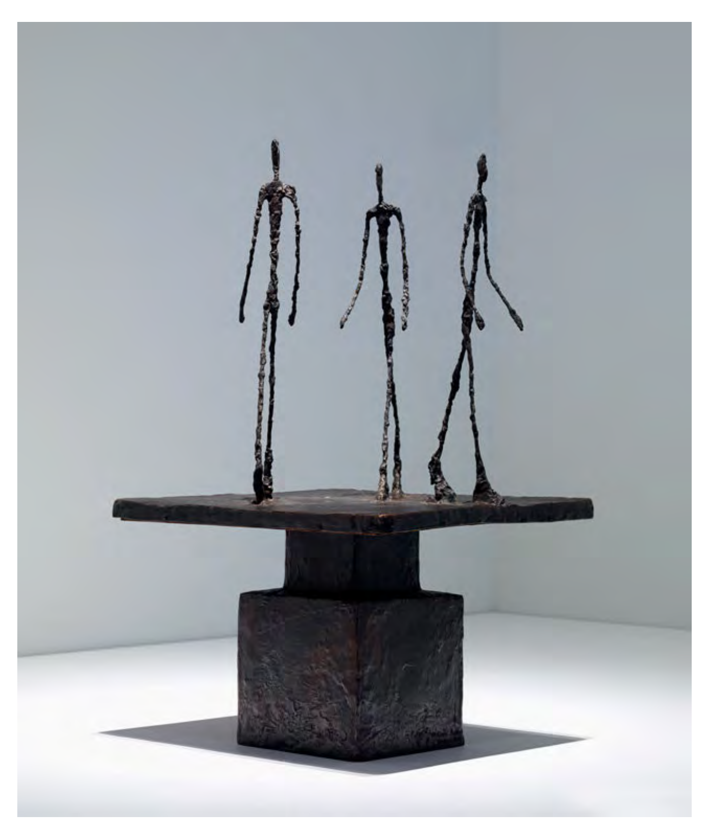
Fig. 2. Alberto Giacometti. Three men walking. 1948. The collection of the Louis Vuitton Foundation, Paris. <a href="https://www.fondationlouisvuitton.fr/en/the-collection.html">https://www.fondationlouisvuitton.fr/en/the-collection.html</a>

if of a god or potentate and its devotees or subjects. This spirit of slums, the king of the walls is scary and omnipotent, his face is a mask and his body a machine, a system that operates in rhythm with the city. His viscera is a labyrinth — a spell guiding a shaman into a state of trance. The mechanistic style of the main figure's interior is intensified in repeated phrases — "Buzzer-bell" "Buzzer-bell" "Buzzer-bell" "Buzzer-bell" "Buzzer-bell" "sugar" "sugar" "sugar" "sugar" "sugar" "sugar" "sugar" "sugar" that arrange the space of the picture. These are the spells of the busy city life, full of machinery sounds, clatters, clicks, and sputters. The repetition of these simple, daily words and sounds produce an effect of mantra.